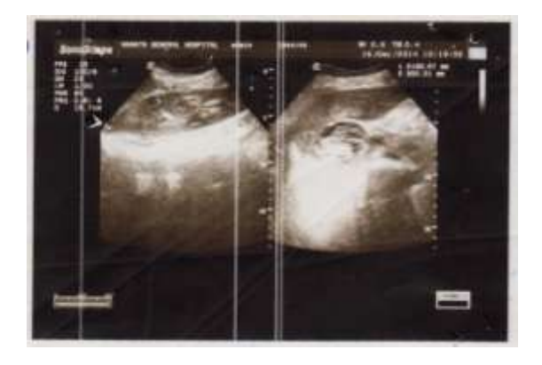
Figure 1 USG Right kidney showing neoplasm

centre with a diagnosis of renal cell carcinoma for further management, where she underwent right radical nephrectomy. Histopathological assys of the radical nephrectomy specimen confirmed the tumor of size 4.5x3.5x3 cm with the diagnosis of renal cell carcinoma (TNM stage-I, pT1b N0 Mo). On follow up at 12 weeks, both the mother and the baby were found to be asymptomatic.